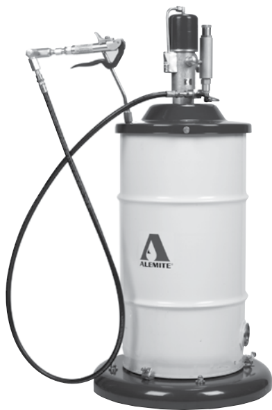
Drum Not Included

Alemite H- and Super H-Pumps are designed for intermittent use in medium- and high-pressure industrial applications where portability is a factor. Double-acting H-Pumps easily handle lightweight as well as fibrous lubricants. Downtubes are available in various lengths to match container size requirements.